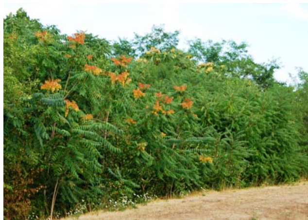
Hoosier Heartland RC & D