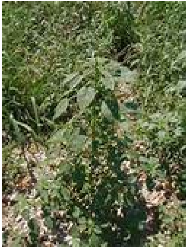
Missouri State University