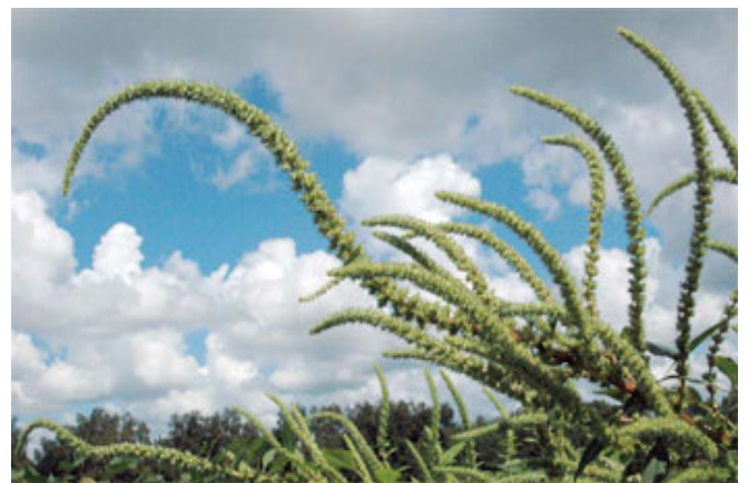
University of Georgia