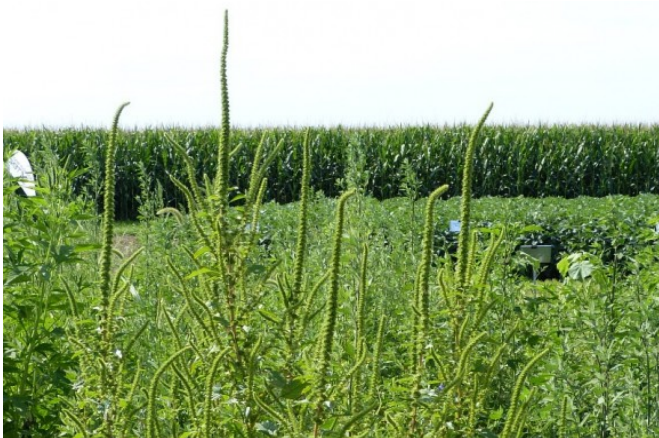
Hoosier Ag Today

Palmer amaranth is a native to the southwestern deserts of the US and has invaded Indiana in the last few years. Palmer amaranth is a green, flowering plant that has caused widespread damage in cotton production in southern states. Most populations are glyphosate-resistant, and the weed thrives in summer heat and can reach heights greater than 7 feet. It is a rapidly growing member (as much as 2 1/2 inches per day) of the Pigweed family. It closely resembles other pigweed species, but no other pigweed has flower and seed panicles over 1 and 1/2 feet in length. Male and female plants grow close together with the male plant having a soft panicle to the touch while the female panicles are bristly to the touch. Extreme caution should be taken in the possible movement of seed by combines and other harvesting equipment.