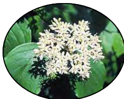
Silky Dogwood/Mature Growth and Bloom Photo—Woody Warehouse Nursery