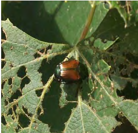
Japanese beetle

Pest management is the identification and control of backyard nuisances—including diseases, insects, weeds, and problematic wildlife. By spotting these issues early and treating them directly and properly, you can drastically improve the health of your backyard.