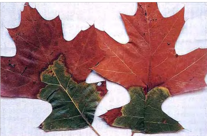
Oak wilt