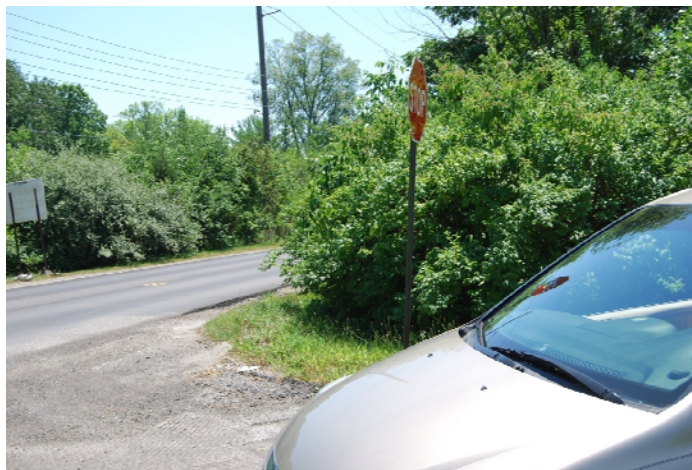
Hoosier Heartland RC&D photos